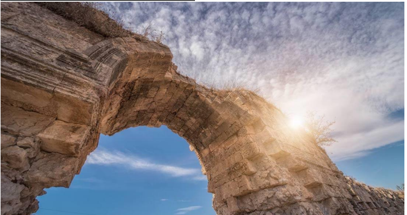
Roman Gladiator Arena Uncovered In Stunning Condition After 2,000 Years

"[The] triumphal arc, which was built in the 3rd century in memory of the Roman Empire's victory against the Persians, looks magnificent."