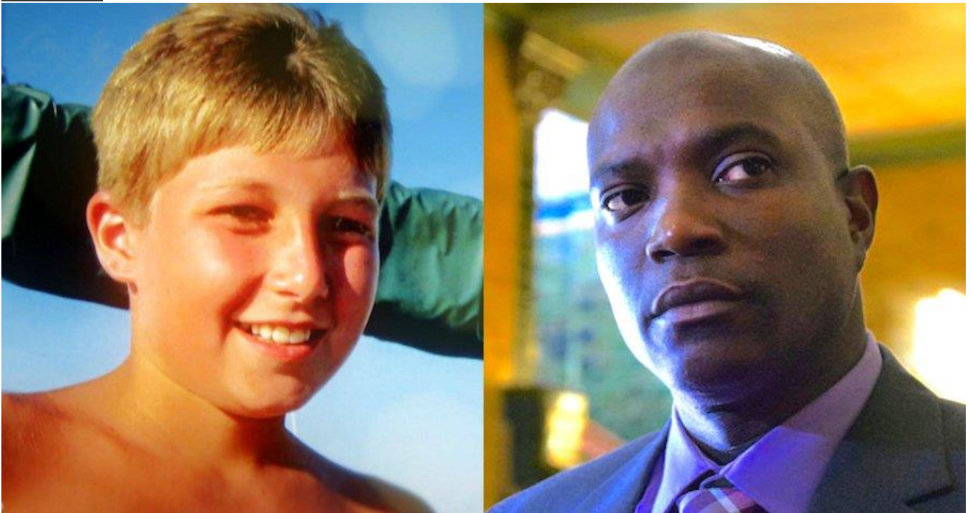
How Police Zeroed In On A Black Man For A 12-Year-Old's Murder — Despite Zero Physical Evidence