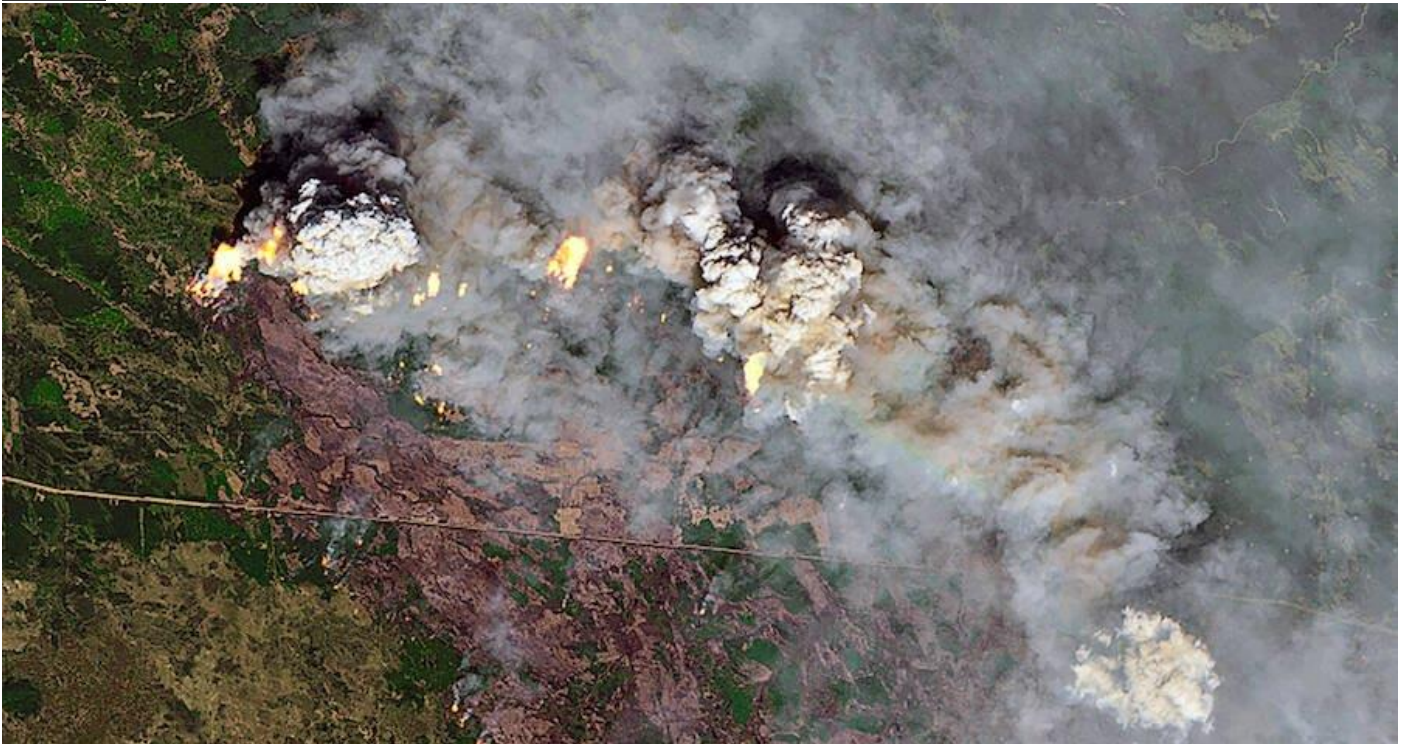
It's Gotten So Hot That The Arctic Is On Fire