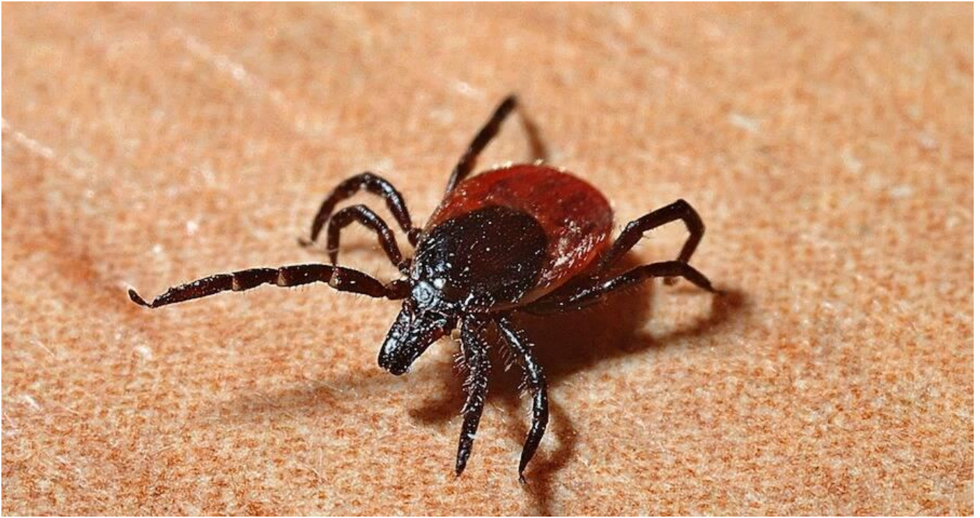
The Pentagon May Have Released Bio-Weaponized Ticks That Created Lyme Disease Outbreak