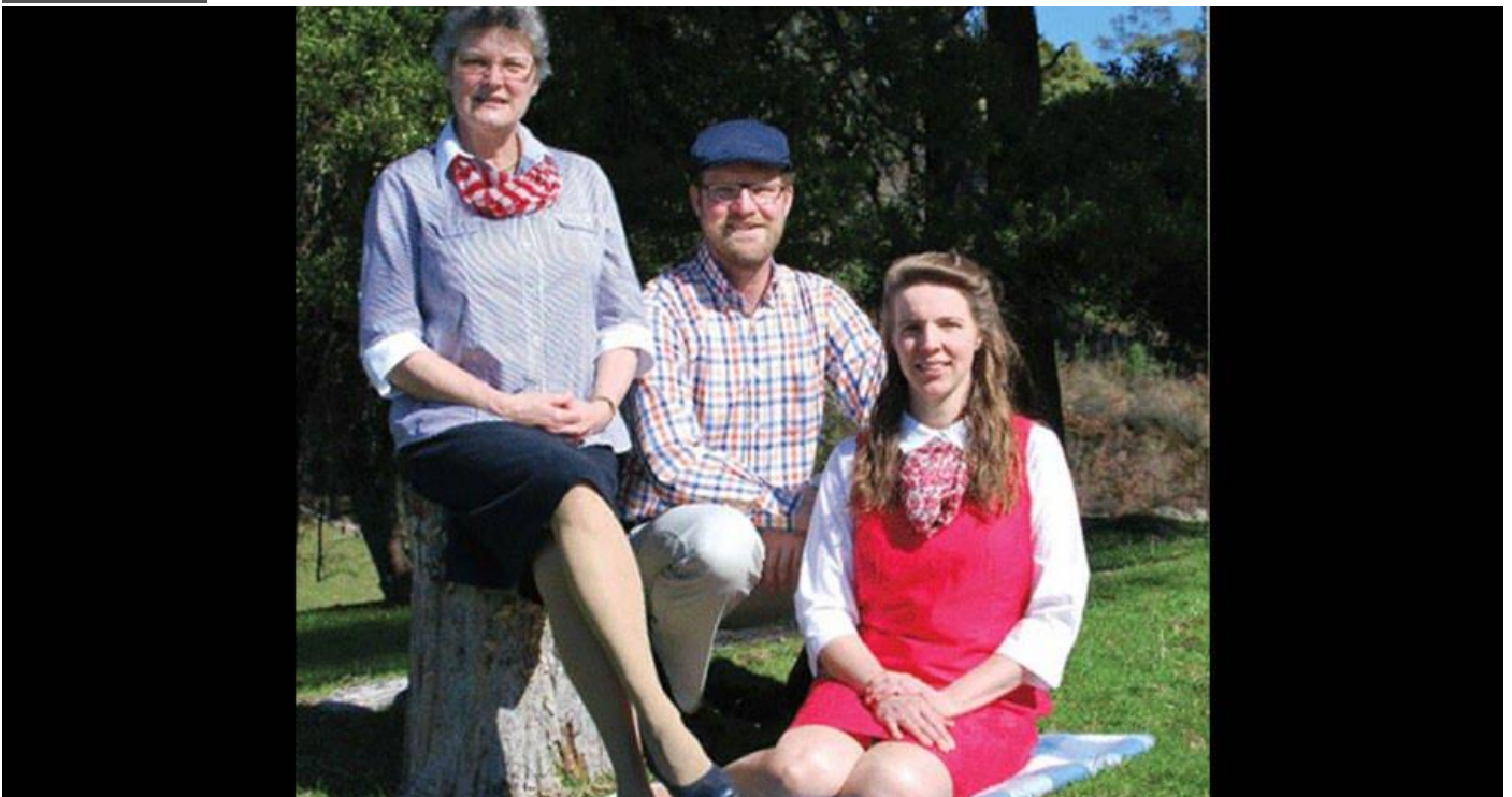
Christian Missionaries Who Claimed Taxes Are 'Against God's Will' Ordered To Pay Back $1.6 Million Sum

"He's my alligator. He's a good boy. He lets me pet him. Come on, baby. Just don't eat my foot, okay?"